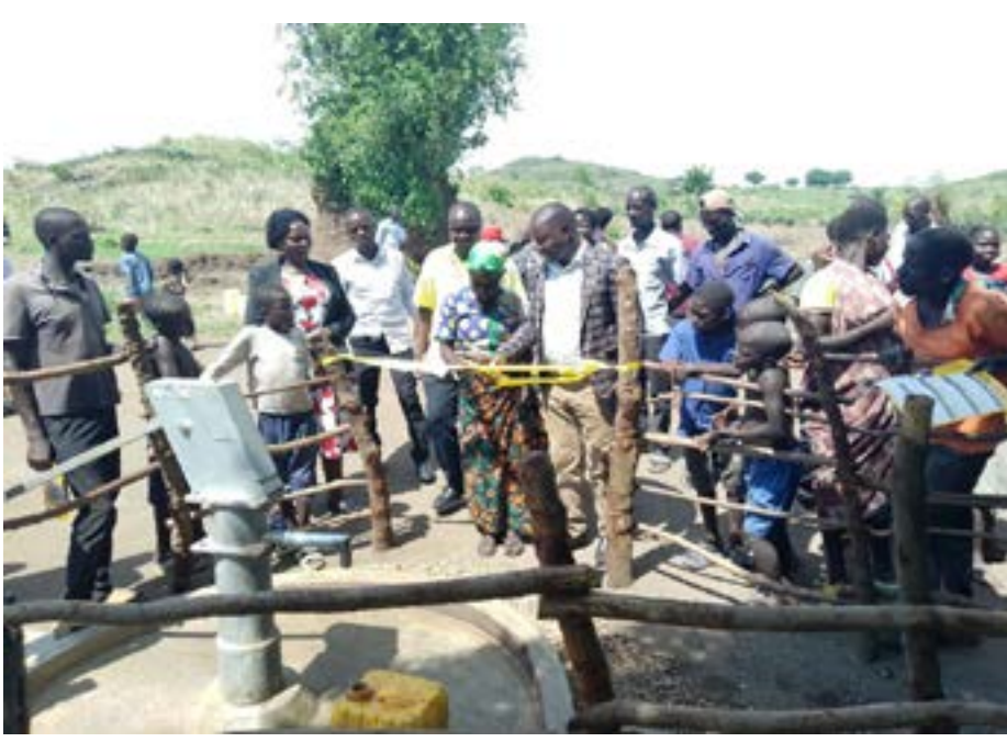
Deputy RDC commissioning the borehole at Olando in GotRao Parish, Dei Sub County

For years, the residents of Kidi Achoka, Olando, and Munduriema villages have faced a daily struggle: the relentless search for clean water.