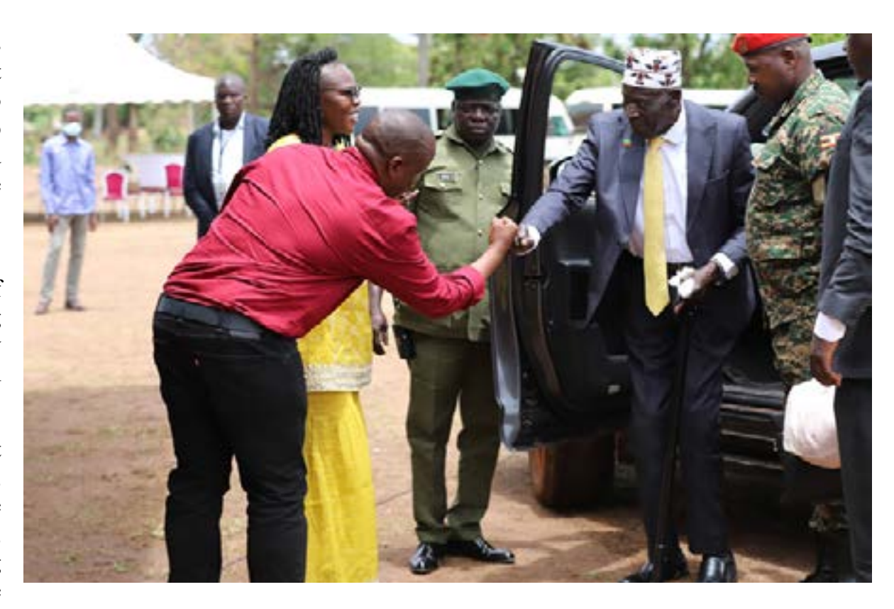
Minister Balaam Barugahara receives the 2nd Deputy Prime Minister, Hon. Dr. Gen. Moses Ali to the Peace Day celebrations.