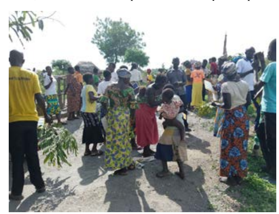
The community welcoming the team for commissioning

Each project, costing 38,500,000 Ugandan shillings, is more than just a water source; it's a symbol of hope, a promise of improved health, and a testament to the power of community development.