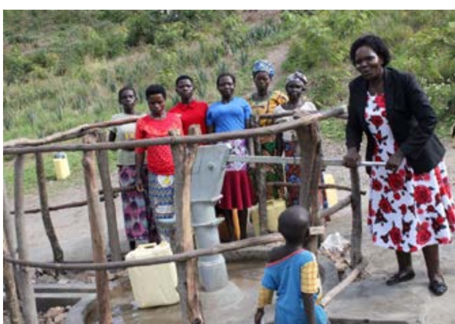
The DCAO with residents of Kidiachoka after commissioning of the Bore hole

"Since my childhood, I had never seen any proper and clean source of water in this village," he states.