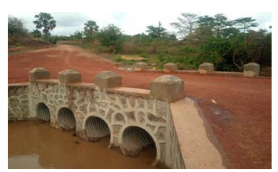
Abele to Nyangilia road opened and 4 lines of culvert bridge installed

Similarly, Musala Salila, along with other residents, appealed to the government to upgrade key roads connecting Koboko Municipality to the neighboring Democratic Republic of Congo and South Sudan to tarmac status, serving as a catalyst for further socioeconomic prosperity in the West Nile sub-region.