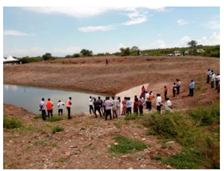
Valley dam constructed in Gotar in Ossi East Parish in Parombo Sub County

According to Fualing Doreen, the District Natural Resources Officer, the district has planted trees along 138 kilometers of road reserves as part of the same project. Additionally, trees have also been planted in 10 schools and 26 health units throughout the district.