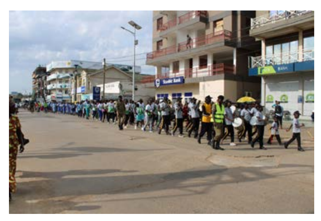
Endless queues of walkers match to create awareness; including CSOs, Indian Community of Arua, Civil Servants, schools and the general public

ARUA- 10<sup>th</sup> April 2025 dawned as a special day in Arua City as stake-holders walked against malaria. This event was organized by Uganda Parliamentary Forum on Malaria as a strategy to create awareness about Malaria, how to prevent it and the different government interventions aimed at reducing the spread of malaria and subsequently reduce the deaths associated to malaria.