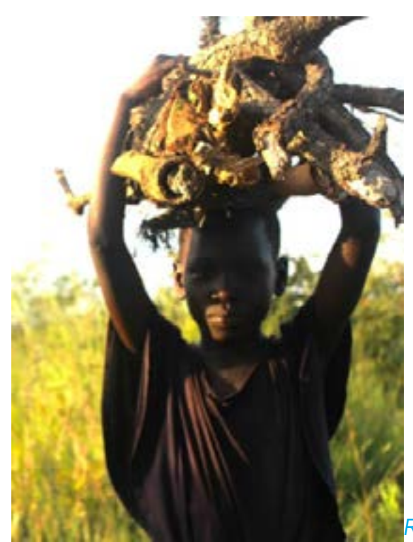
Refugee boy Carrying fire wood

(IPCC) a scientific group assembled by the United Nations that monitors and asses all global science related to climate change, this is due to the increasing demand on the environment and land to accommodate the growing population as well as like timber and wood fuel.