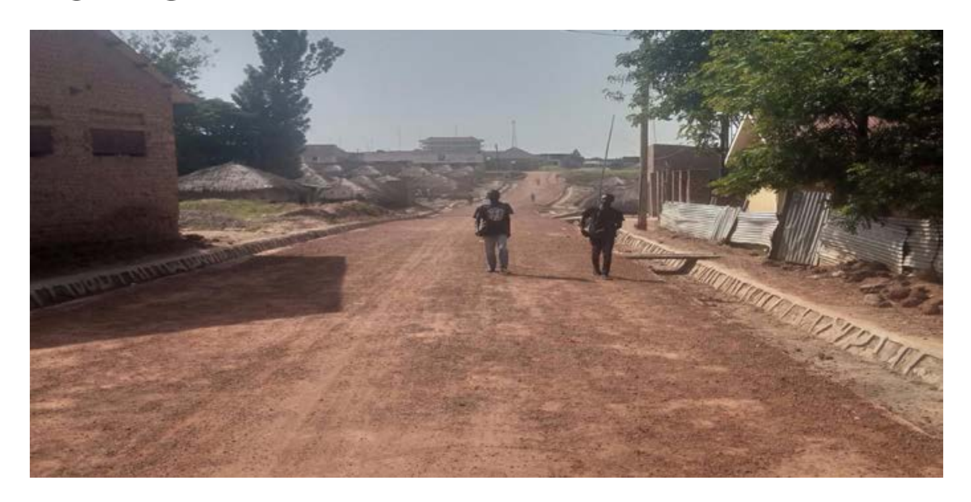
A well maintained roads in the outskirts of Koboko Town making the town accessible to the residents

oboko Municipality - One billion Uganda shillings road fund has driven socio-economic transformation in Koboko Municipality as pathways have been created where there were no roads.