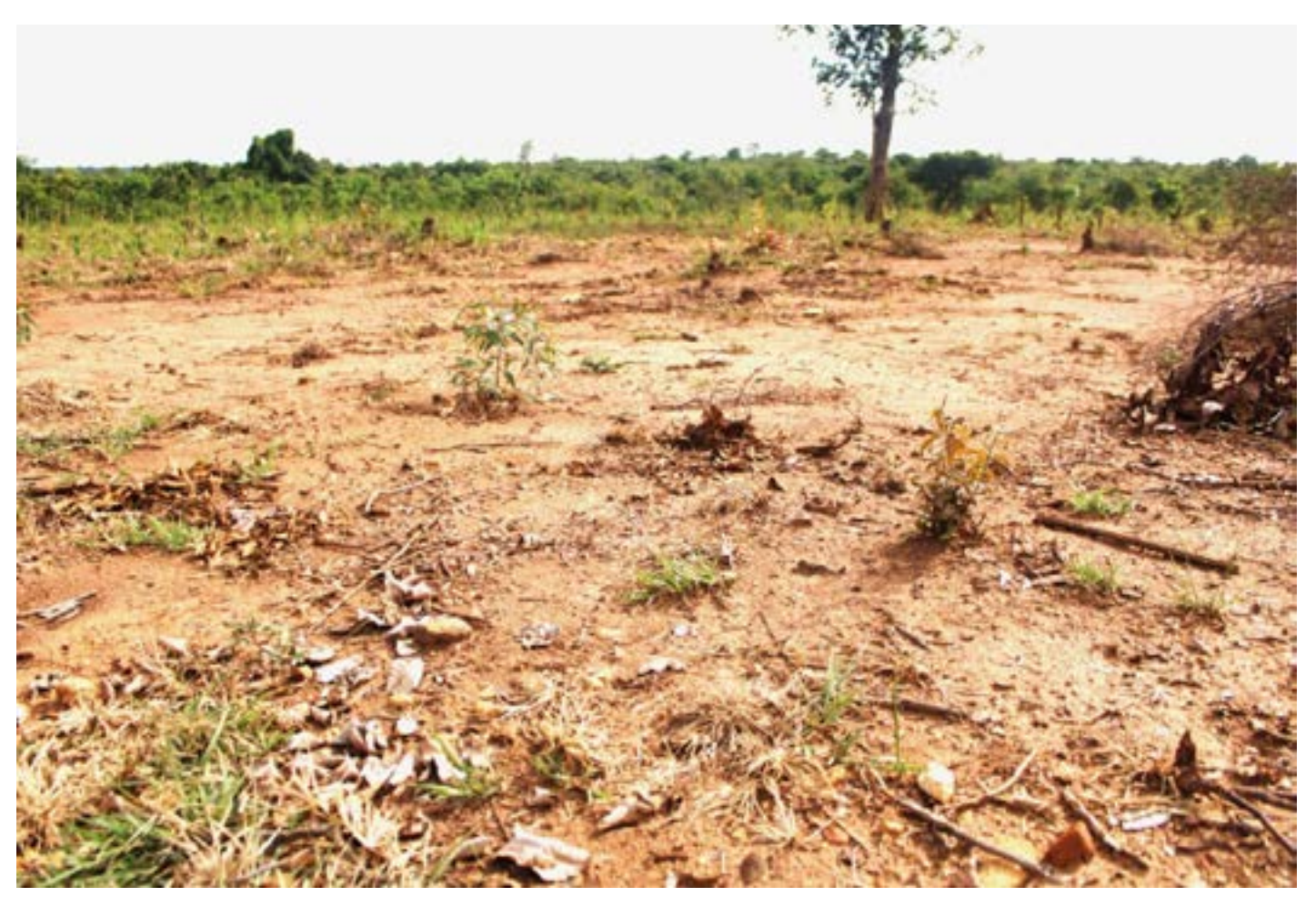
A section of Ananga village in Yumbe District before DRDIP

According to scientists, trees help improve soil health due to the ability of the roots to improve the capacity of soil to absorb water and nutrients and they also reduce the risk of wind erosion.